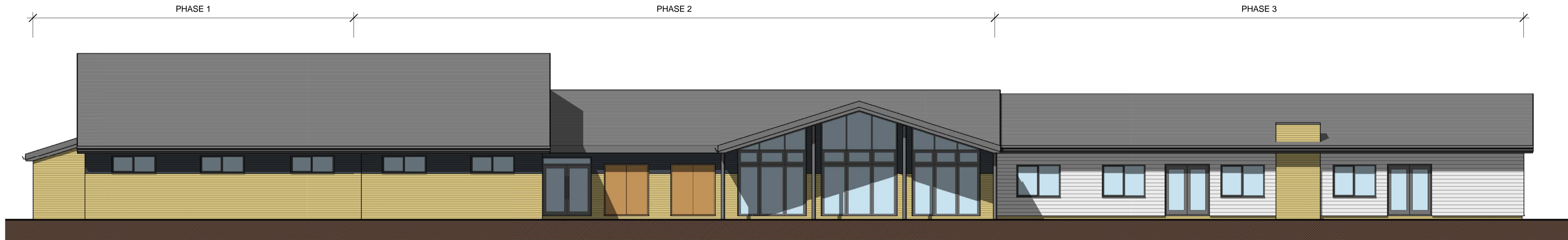
Proposed North West Elevation 1:100